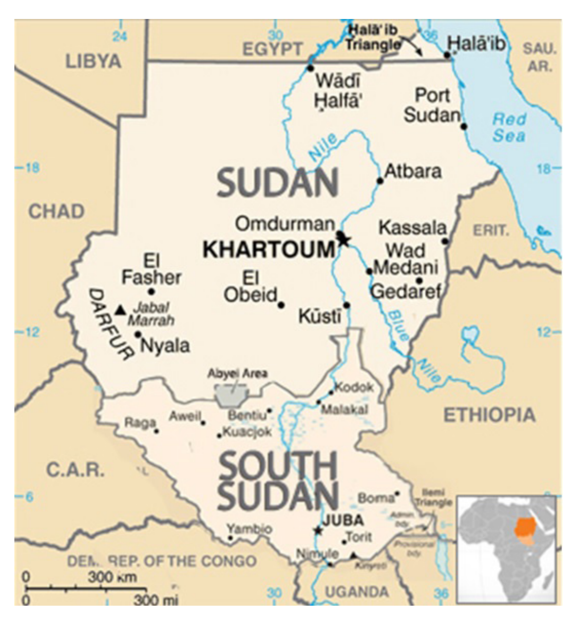
FIGURE I The Map of the Sudan and South Sudan